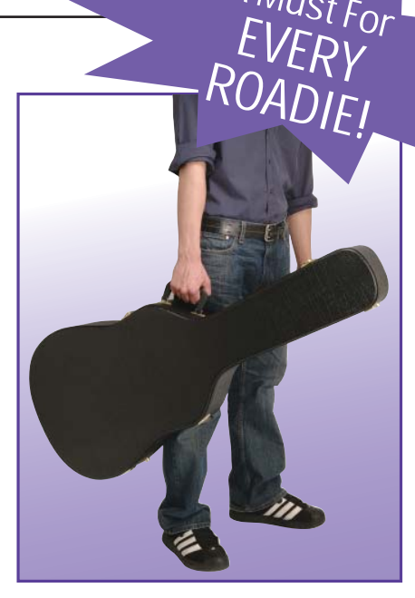
Carry all of your gear with comfort and style!